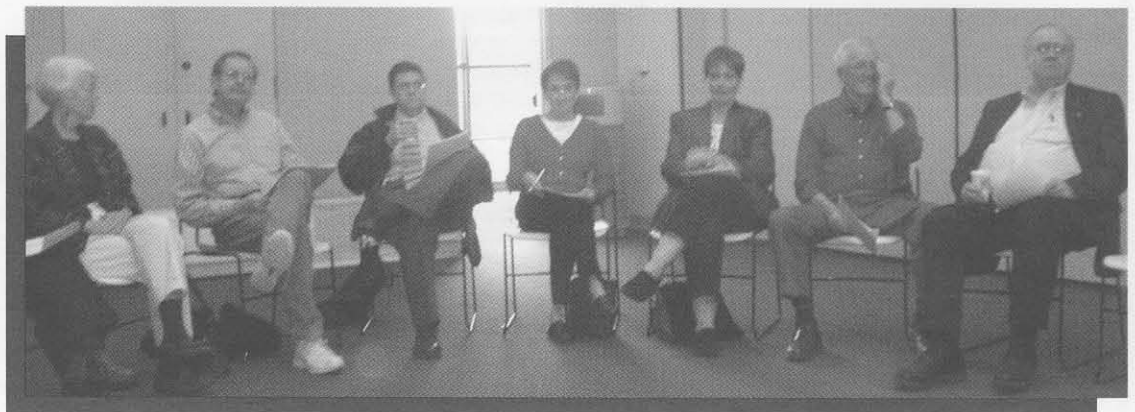
Community members gather for a forum at the Bettendorf Public Library.